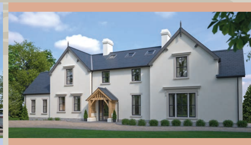
NUMBER 07 | THE MAGILL Floor Area: 4310 sq ft approx 5 Bedroom Detached Home Plot size: 0.50 acre