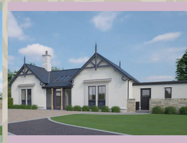
NUMBER 05 | THE CUNNINGHAM Floor Area: 3517 sq ft approx 4 Bedroom Detached Home Plot size: 0.39 acre