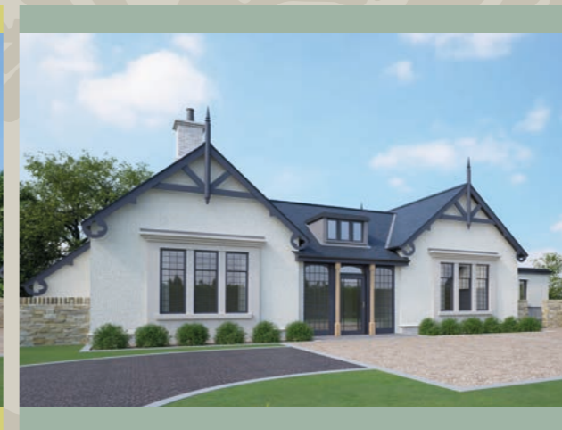
NUMBER 04 | THE HAMILTON Floor Area: 3517 sq ft approx 4 Bedroom Detached Home Plot size: 0.33 acre