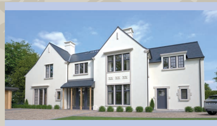
NUMBER 06 | THE WILSON Floor Area: 3635 sq ft approx 5 Bedroom Detached Home Plot size: 0.35 acre