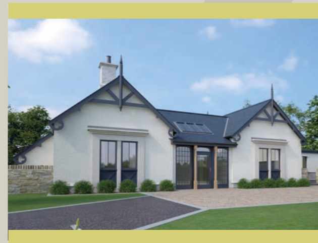
NUMBER 03 | THE DIXON Floor Area: 3517 sq ft approx 4 Bedroom Detached Home Plot size: 0.31 acre

This exclusive collection of five luxury homes offers a once in a lifetime opportunity to settle in one of Northern Ireland's most sought-after towns.